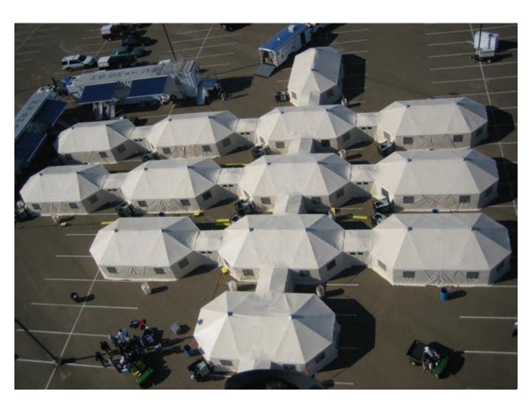
Thirteen 1935s connected by vestibules make up this field hospital.

Beds, work stations, tables, seating and food prep