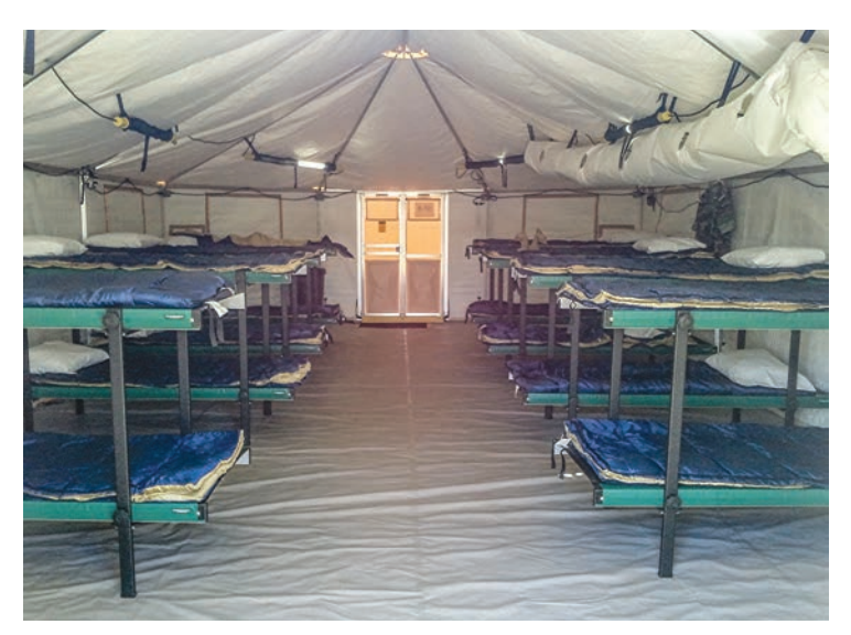
Shelter billeting featuring Western Shelter bunk beds, air distribution plenum, lighting and wiring harness.

MILITARY INDUSTRIAL FIRST RESPONDER MEDICAL HOMELAND SECURITY EVENTS