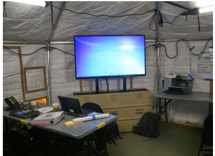
20 system shelter featuring SDI equipment set up and ready for use.